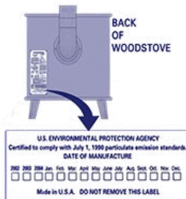
Permanent Wood Stove Label affixed to a stove